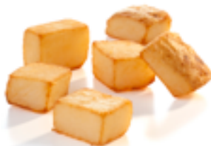
SKIN-ON BREAKFAST BROWNS 56210 30319