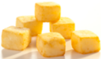
LARGE DICED POTATOES 56210 04109