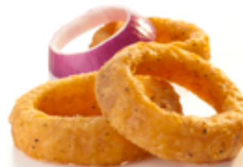
JERSEY SHORE® SPICY RED ONION RINGS 55776 00092