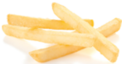
3/8" STRAIGHT CUT 56210 05502 56210 05602