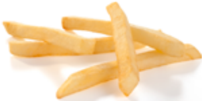
3/8" REGULAR STRAIGHT CUT, XLF 56210 30004