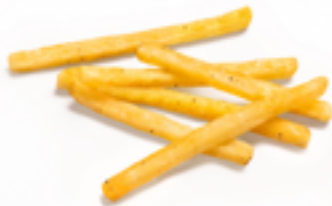
SEASONED THIN CUT FRIES 97644 94824