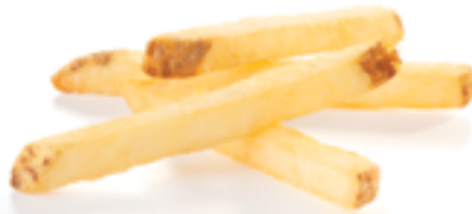
3/8" STRAIGHT CUT SKIN-ON 56210 05606 56210 05506