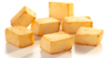
SMALL DICED POTATOES 56210 04119