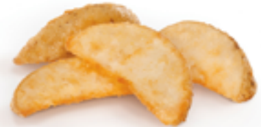
POTATO WEDGE, SKIN-ON 56210 05225