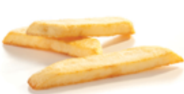
STEAK CUT 56210 34013