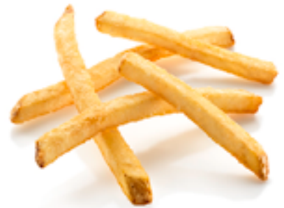
SHOESTRING, SKIN-ON 56210 05521