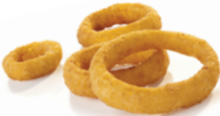
1/2" CRISPY BEER-FLAVORED ONION RINGS 56210 15450