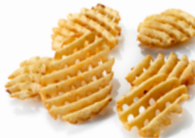
CRISPY LATTICE CUT, SKIN-ON 56210 05508