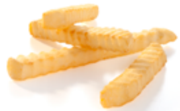
1/2" CRINKLE CUT, XLF 56210 30006