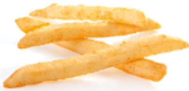
3/8" STRAIGHT CUT 56210 05301 56210 05307** 56210 05601

Golden fries with a buttery texture – Clear Coat products offer a classic French fry taste to suit any menu and any craving. Our crispy Clear Coat coating ensures these fries provide an unbeatable taste every time.