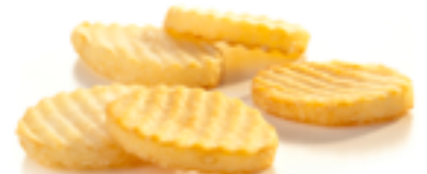
POTATO DOLLARS - CRINKLE SLICES 56210 04014