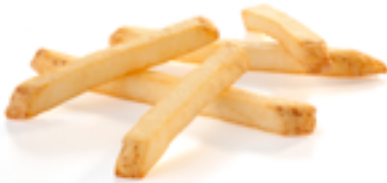
3/8" STRAIGHT CUT, SKIN-ON, BRINED, XLF 56210 30122

These premium, quick to prepare French fries deliver top quality and consistency year round.