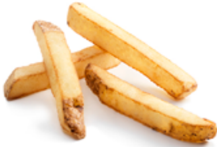
1/2" RUSSET, STRAIGHT CUT SKIN-ON, SEA SALT 56210 04562

Enjoy consistent quality while saving time, labor, and energy costs with these natural, hand-cut looking French fries.