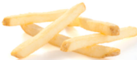
5/16" THIN CUT, SKIN-ON 56210 05505