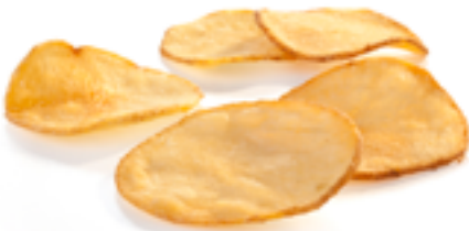
CHIPS, SKIN-ON 56210 20378

Save on the increasing costs of labor and food inflation with FreshCut French fries!