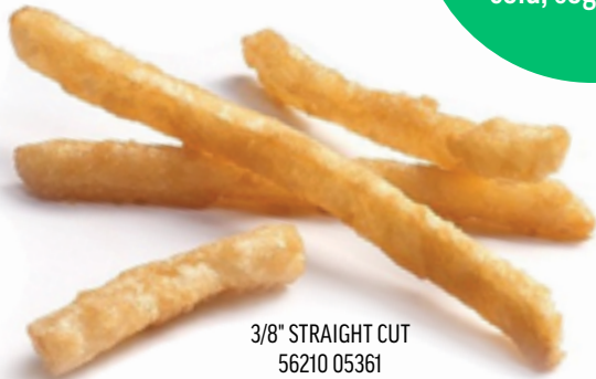
3/8" STRAIGHT CUT 56210 05361