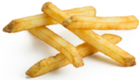
5/16" RUSSET, STRAIGHT CUT SKIN-ON, SEA SALT 56210 04550