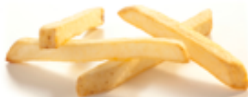
3/8" STRAIGHT CUT, SKIN-ON 56210 04504