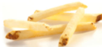
5/16" THIN CUT, SKIN-ON 56210 04501