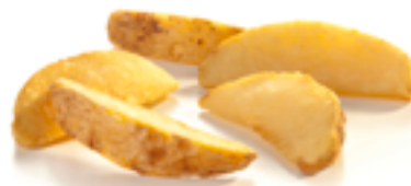
WEDGE, SKIN-ON 56210 04019