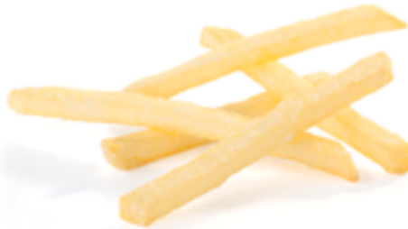
SHOESTRING 56210 05501

Fine Coat XLF fries boast premium, extra-long lengths offering maximum yields for your plates.