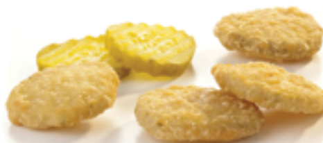
CRISPY TEMPURA PICKLE CHIPS 56210 17147