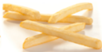
5/16" THIN, STRAIGHT CUT 56210 34001