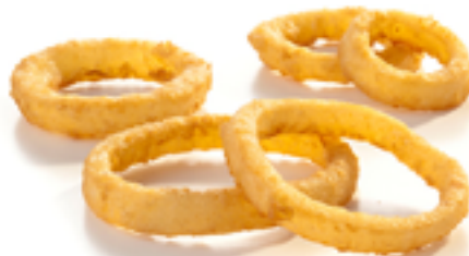
1/4" CRISPY TEMPURA ONION RINGS 56210 15100 - 1 X 2 KG 56210 15105 - 1 X 4 KG 56210 15303 - 60 X 4 OZ FAST PACK™ 56210 15110 - 4 X 60 OZ FAST PACK™