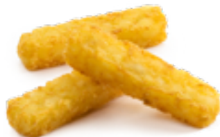
HASH BROWN STICKS 56210 41575