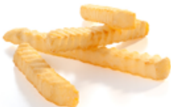
SELECT CLASSIC CRINKLE CUT 56210 34022