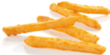
3/8" PUB FRIES™ STRAIGHT CUT, EXTRA CRUNCH 56210 55185