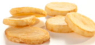
POTATO DOLLARS - REGULAR CUT 56210 04016