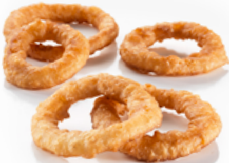
1/4" CRISPY TEMPURA ONION RINGS 56210 05363