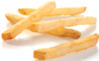
3/8" PUB FRIES™ STRAIGHT CUT, SKIN-ON 56210 05004