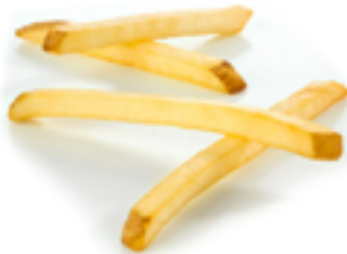
5/16" THIN STRAIGHT CUT, SKIN-ON, BRINED, XLF 56210 30124