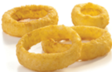
1/2" CRISPY TEMPURA ONION RINGS 56210 15120