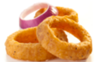
JERSEY SHORE® SPICY RED ONION RINGS 55776 00092