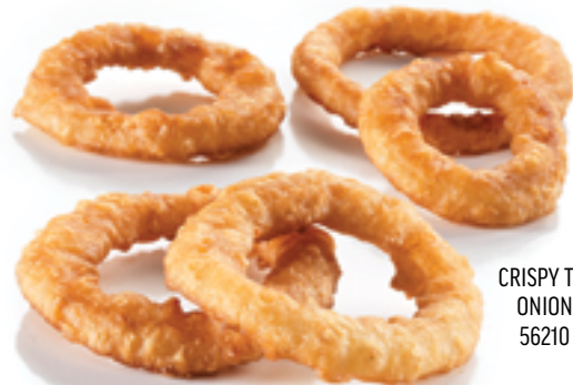
CRISPY TEMPURA ONION RINGS 56210 05363