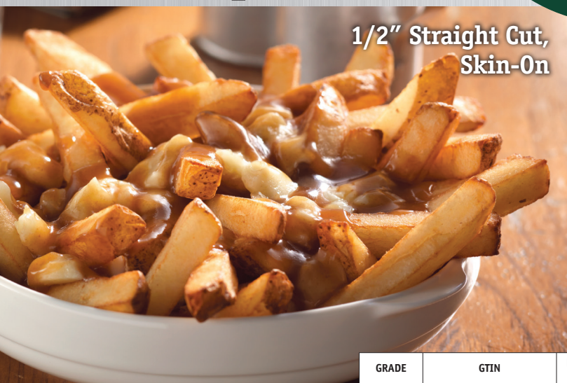
1/2" Straight Cut, Skin-On

Provide your customers with the perfect fry every time; AND save on increasing labor costs!