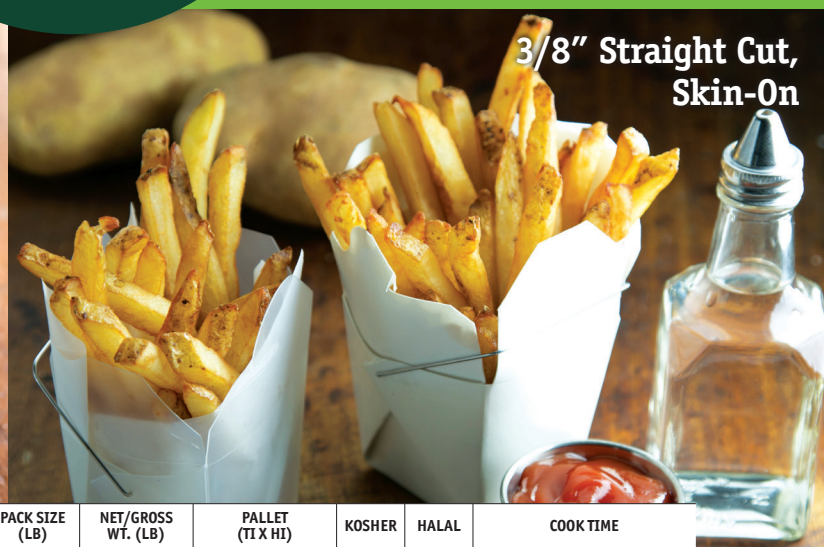
3/8" Straight Cut, Skin-On