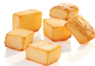
CAVENDISH FARMS® SELECT SKIN-ON BREAKFAST BROWNS 56210 30319