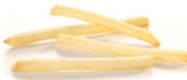
CAVENDISH FARMS® 1/4" SHOESTRING 56210 34011