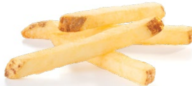
FINE COAT™ 3/8" STRAIGHT CUT - SKIN-ON - XLF 56210 05506