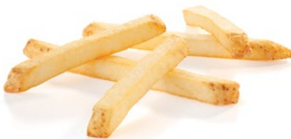
CAVENDISH FARMS® 3/8" SELECTPLUS REGULAR CUT SKIN-ON - BRINED 56210 30122