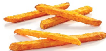
CLEAR COAT 1/2" X 1/4" SWEET POTATO FRIES SLIM STEAK CUT SKIN-ON 56210 20811