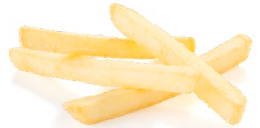
FINE COAT™ 5/16" THIN CUT - XLF 56210 05503