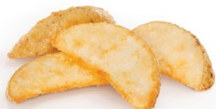
CLEAR COAT 8-CUT POTATO WEDGE - SKIN-ON 56210 05225