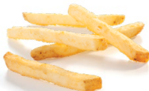
CLEAR COAT PUB FRIES™ 3/8" STRAIGHT CUT - SKIN-ON 56210 05004