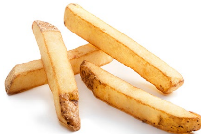
FRESHCUT 1/2" RUSSET FRIES SKIN-ON WITH SEA SALT 56210 04562