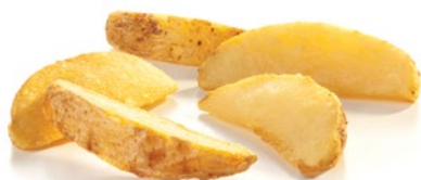
CAVENDISH FARMS® 10-CUT WEDGE SKIN-ON 56210 04019