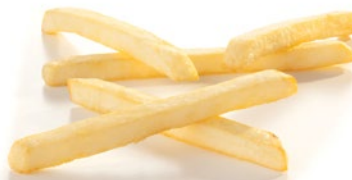
CAVENDISH FARMS® 5/16" SELECT THIN CUT 56210 30001