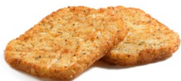
CAVENDISH FARMS® HERB & CRACKED PEPPER PATTIES 10CT TRAY 56210 37105