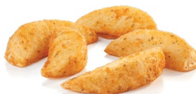
FLAVOR CRISP™ 8-CUT SEASONED POTATO WEDGE - SKIN-ON 56210 05223