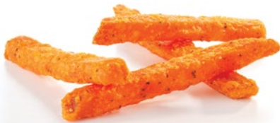
JERSEY SHORE® 3/8" X 1/2" SEASONED THICK CUT SWEET POTATO FRIES - SKIN-ON 55776 00091

Jersey Shore® fries are made with premium skin-on potatoes and select sweet potatoes. They're cut thick and dressed with a signature savory, garlic and cracked black pepper batter. Lightly coated with sea salt, they deliver a superior taste customers love and come back for. Ask for the original. Ask for Jersey Shore®.