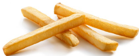
FRESHCUT 1/4" SHOESTRING RUSSET FRIES SKIN-ON WITH SEA SALT 56210 04563