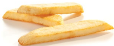
CAVENDISH FARMS® STEAK CUT 56210 34013