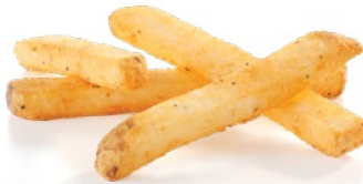
JERSEY SHORE® 3/8" X 1/2" SEASONED THICK CUT FRIES - SKIN-ON 55776 00090