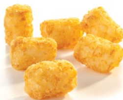
CAVENDISH FARMS® GOLDEN NUGGETS - OVENABLE 56210 04101