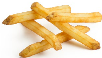
FRESHCUT 5/16" RUSSET FRIES SKIN-ON WITH SEA SALT 56210 04550