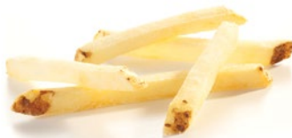
CAVENDISH FARMS® 5/16" THIN CUT - SKIN-ON 56210 04501