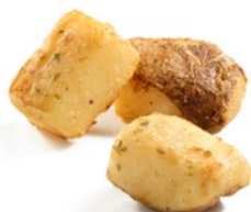
FLAVOR CRISP™ TUSCAN HERB HEARTY CUT ROASTS 56210 04131

THE HOLD TIME ON THESE CRINKLE MEDALLIONS (56210 05490) MAKE THEM PERFECT FOR A TAKE-OUT SNACK!