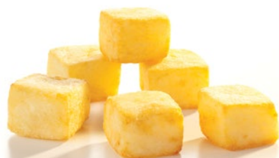
CAVENDISH FARMS® LARGE DICED POTATOES 56210 04109