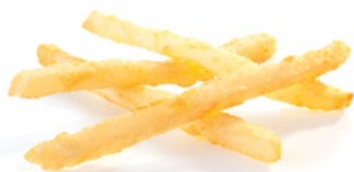
CLEAR COAT 1/4" SHOESTRING 56210 05311