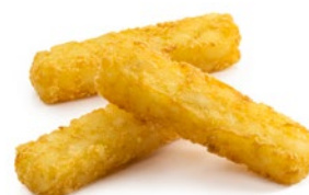
CAVENDISH FARMS® HASH BROWN STICKS 56210 41575