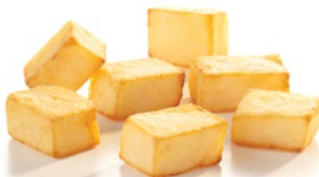
CAVENDISH FARMS® SMALL DICED POTATOES 56210 04119