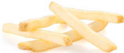
FINE COAT™ 5/16" THIN CUT - SKIN-ON - XLF 56210 05505