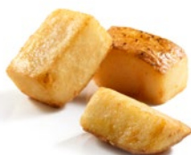
CAVENDISH FARMS® HEARTY CUT ORIGINAL ROASTS 56210 04130

Give your customers the superior potato taste they crave with Cavendish Farms® Traditional Fries. These premium fries are available in skin-on or skinless options and provide a natural look and flavor sought by potato lovers. Cavendish Farms® Traditional Fries are quick to prepare and deliver top quality and consistency year-round.