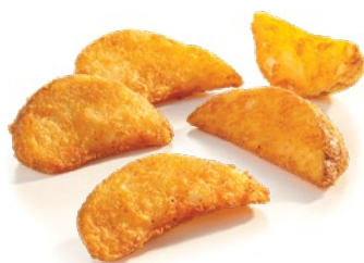
FLAVOR CRISP™ 10-CUT SELECT SPICY POTATO WEDGE - SKIN-ON 56210 35119