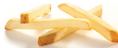
CAVENDISH FARMS® 5/16" SELECTPLUS THIN STRAIGHT CUT SKIN-ON - BRINED 56210 30124