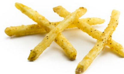
FLAVOR CRISP™ SALT & PEPPER EXTRA THIN FRITES 56210 35923