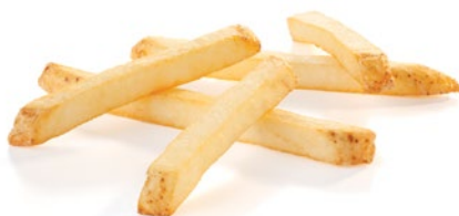
CAVENDISH FARMS® 3/8" STRAIGHT CUT - SKIN-ON 56210 04504