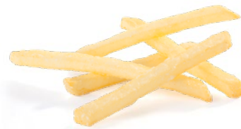
CLEAR COAT 3/8" STRAIGHT CUT - LOW SODIUM 56210 05307