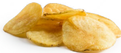
FRESHCUT 1/10" CHIPS, SKIN-ON 56210 20378