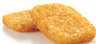
CAVENDISH FARMS® HASHBROWN PATTIES 20 CT TRAY 56210 34217 10 CT TRAY 56210 37106 6 X 5 LB 56210 34500