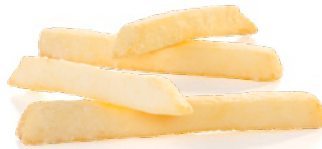
FINE COAT™ 3/8" STRAIGHT CUT - XLF 56210 05502