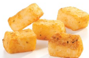
FLAVOR CRISP™ 3/4" X 1/2" X 1" SEASONED DICED - SKIN-ON 56210 05222