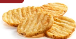
CLEAR COAT 1/4" CLASSIC CRINKLE MEDALLION 56210 05320