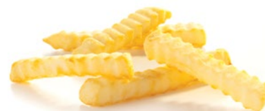
CAVENDISH FARMS® 1/2" CRINKLE CUT 56210 30006