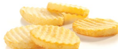
CAVENDISH FARMS® POTATO DOLLARS - CRINKLE SLICES 56210 04014