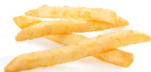
CLEAR COAT 3/8" STRAIGHT CUT 56210 05301