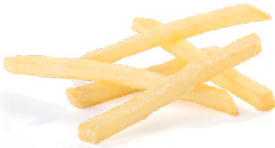
FINE COAT™ 1/4" SHOESTRING - XLF 56210 05501

It's the best of both worlds! Get all the advantages of a traditional fry with the benefits of a coated fry. Its amazing invisible coating keeps fries hot and crispy longer while locking in the great potato flavor. Fine Coat™ XLF fries provide great plate coverage and deliver more profits per serving.