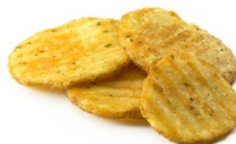
FLAVOR CRISP™ TUSCAN HERB CRINKLE MEDALLIONS 56210 05490