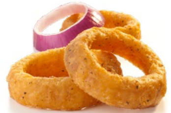
JERSEY SHORE® 5/8" CRISPY RED ONION RINGS 55776 00092

JERSEY SHORE SWEET POTATO FRIES (55776 00091) ARE A DELICIOUSLY SWEET FRY COVERED IN OUR SIGNATURE BATTER.