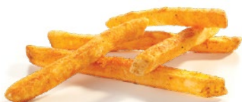
FLAVOR CRISP™ 3/8" SELECT SPICY STRAIGHT CUT 56210 35101