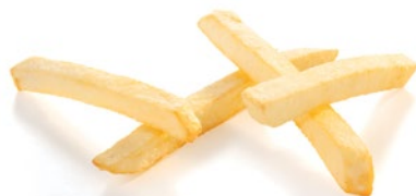
CAVENDISH FARMS® 3/8" SELECT REGULAR STRAIGHT CUT 56210 30004