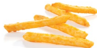
CLEAR COAT PUB FRIES™ EXTRA CRUNCH 3/8" STRAIGHT CUT 56210 55185