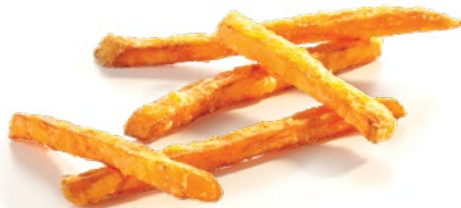
CLEAR COAT 3/8" SWEET POTATO FRIES EXTRA CRISP 56210 20812