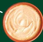
Spicy Chipotle Mayo