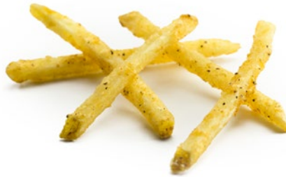
FLAVOURCRISP™ SALT & PEPPER EXTRA THIN FRITES - SKIN-ON 56210 05920