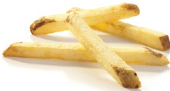
FRESHCUT 7/16" KENNEBEC STRAIGHT CUT - SKIN-ON 56210 04585