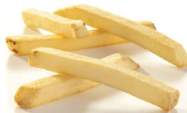
CAVENDISH FARMS® 7/16" STRAIGHT CUT - ORIGINAL STRIPS - SKIN-ON 56210 04304