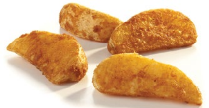
FLAVOURCRISP™ 10-CUT SPICY POTATO WEDGE - SKIN-ON 56210 05718