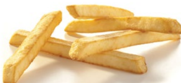
CAVENDISH FARMS® 7/16" STRAIGHT CUT DARK OLD FASHIONED 56210 04216