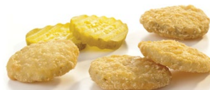
CAVENDISH FARMS® CRISPY TEMPURA PICKLE CHIPS 56210 19106