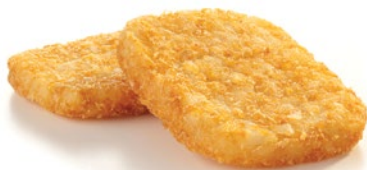
CAVENDISH FARMS® HASH BROWN PATTIES (60-64G) 56210 34510

Cavendish Farms® large diced potatoes (56210 04110).