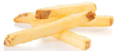
FINE COAT™ 3/8" STRAIGHT CUT - SKIN-ON 56210 07750