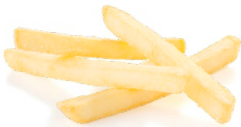
FINE COAT™ 7/16" STRAIGHT CUT 56210 07720