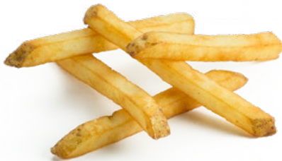
FRESHCUT 3/8" RUSSET STRAIGHT CUT - SKIN-ON 56210 04551

FreshCut 1/2" Russet straight cut skin-on (56210 04552).