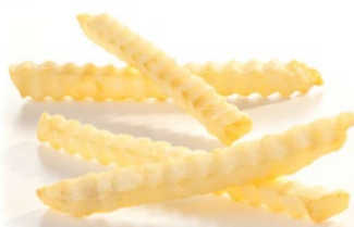
CAVENDISH FARMS® 3/8" CRINKLE CUT 56210 04666