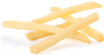
FINE COAT™ 9/32" SHOESTRING 56210 07710

It's the best of both worlds. Get all the advantages of a traditional fry with the benefits of a coated fry. Its amazing invisible coating keeps fries hot and crispy longer while locking in great potato flavour. Fine Coat™ XLF fries provide great plate coverage and deliver more profits per serving.