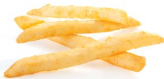
CLEAR COAT 3/8" STRAIGHT CUT 56210 05315