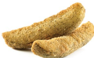
CAVENDISH FARMS® BREADED PICKLE SPEARS 56210 19107