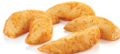
FLAVOURCRISP™ 10-CUT GARLIC & ROSEMARY WEDGE - SKIN-ON 56210 37227