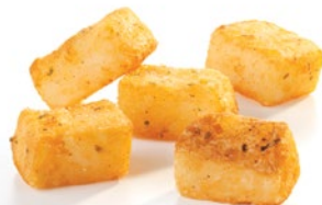
FLAVOURCRISP™ TUSCAN HERB SMALL DICED - SKIN-ON 56210 05999