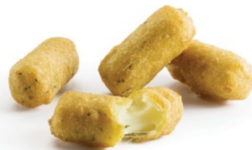
CAVENDISH FARMS® CRISPY TEMPURA CHEESE BITES 56210 19187