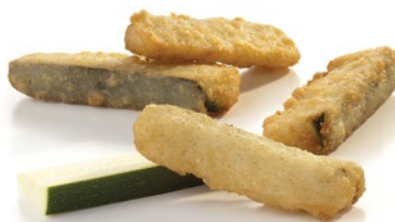
CAVENDISH FARMS® CRISPY TEMPURA ZUCCHINI STICKS 56210 19160