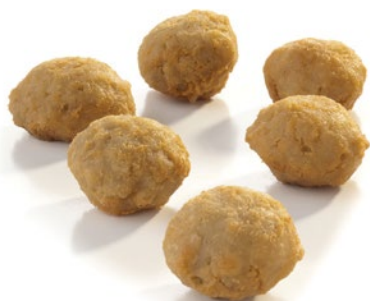
CAVENDISH FARMS® CRISPY TEMPURA BUTTON MUSHROOMS 56210 19120