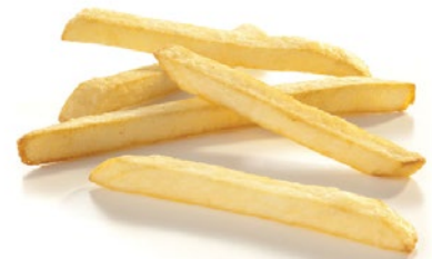
CAVENDISH FARMS® 3/8" STRAIGHT CUT - ORIGINAL STRIPS 56210 04601