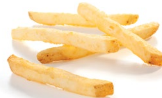
CLEAR COAT 7/16" STRAIGHT CUT - SKIN-ON 56210 05312