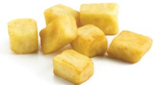
FRESHCUT 7/16" DARK RED NORLAND SMALL DICED - 3/4" X 1/2" X 1" 56210 04575