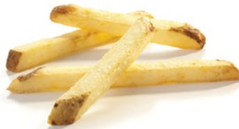
FRESHCUT 7/16" KENNEBEC STRAIGHT CUT - SKIN-ON W/SEA SALT 56210 04580