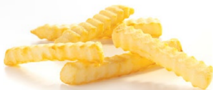
CAVENDISH FARMS® 7/16" CRINKLE CUT 56210 04003