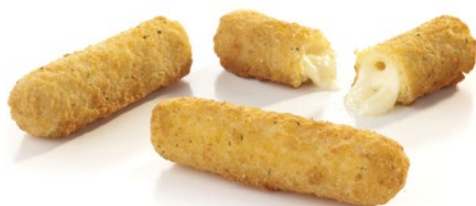
CAVENDISH FARMS® GOURMET RAW BREADED MOZZARELLA STICKS 56210 19184