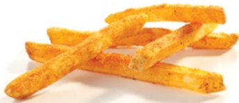
FLAVOURCRISP™ 3/8" SPICY STRAIGHT CUT - SKIN-ON 56210 05701