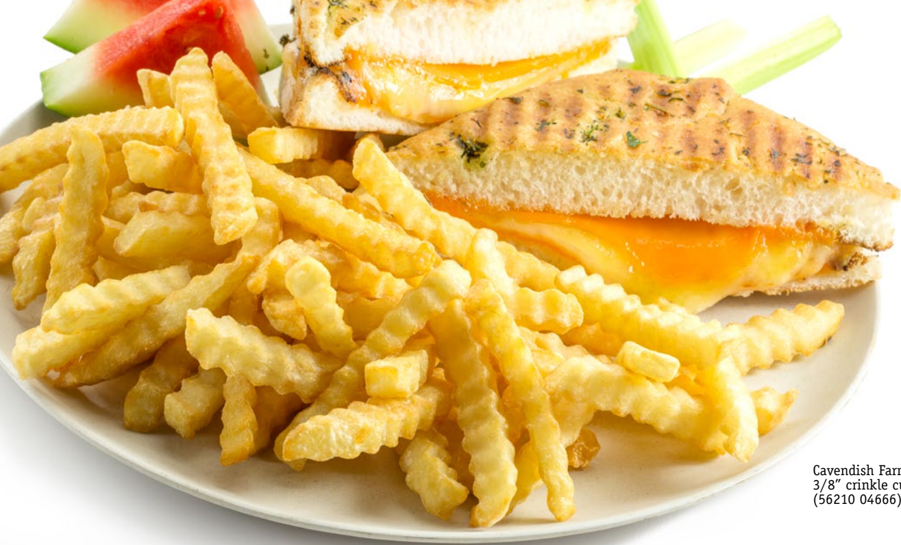
Cavendish Farms® 3/8" crinkle cut french fries (56210 04666).