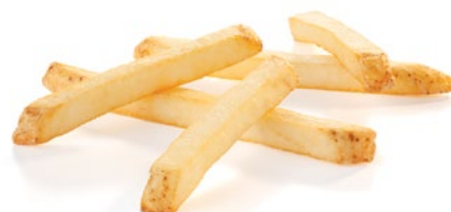
CAVENDISH FARMS® 7/16" STRAIGHT CUT - BRINED - SKIN-ON 56210 30132