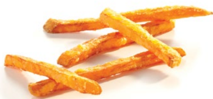
CLEAR COAT 3/8" SWEET POTATO FRIES EXTRA CRISP 56210 36812