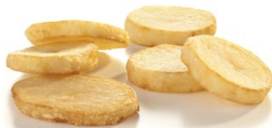
CAVENDISH FARMS® POTATO DOLLARS - REGULAR CUT 56210 42555