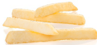
FINE COAT™ 3/8" STRAIGHT CUT 56210 07730