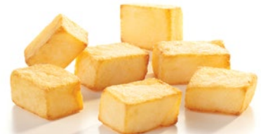
CAVENDISH FARMS® SMALL DICED POTATOES 3/4" X 1/2" X 1" 56210 04112