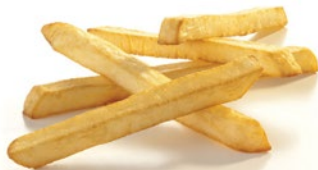
CAVENDISH FARMS® 3/8" STRAIGHT CUT DARK OLD FASHIONED 56210 04211