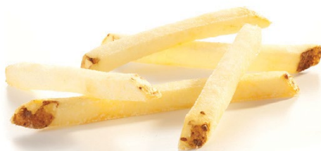
CAVENDISH FARMS® 9/32" SHOESTRING - BRINED - SKIN-ON 56210 30140