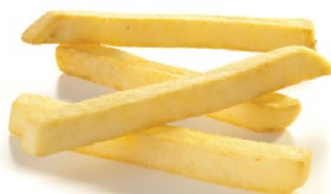
CAVENDISH FARMS® 7/16" STRAIGHT CUT - ORIGINAL STRIPS 56210 04104