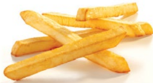
FRESHCUT 3/8" DARK RED NORLAND STRAIGHT CUT 56210 04571