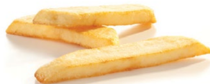
CAVENDISH FARMS® 7/16" X 7/8" STEAK CUT 56210 04013