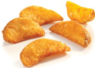
FLAVOURCRISP™ TUSCAN HERB WEDGE, 8-CUT - SKIN-ON 56210 05998