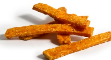
CLEAR COAT SWEET POTATO PLANK CUT FRIES 56210 36820