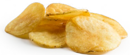
FRESHCUT 1/10" CHIPS - SKIN-ON 56210 20455