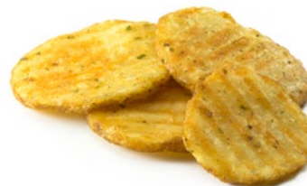
FLAVOURCRISP™ TUSCAN HERB - CRINKLE MEDALLIONS 56210 35490