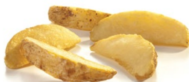
CAVENDISH FARMS® 10-CUT WEDGE SKIN-ON 56210 04020