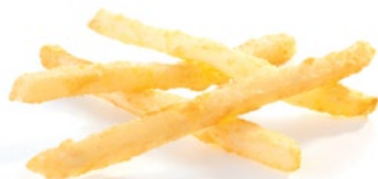
CLEAR COAT 9/32" SHOESTRING 56210 05313

Customers love golden fries with a real buttery taste and that's exactly what Clear Coat delivers. For 20 years Cavendish Farms® has been a leader in coated fries and our proprietary recipe ensures they provide an unbeatable taste every time.