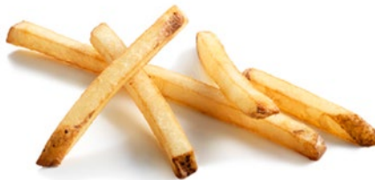
FRESHCUT SHOESTRING RUSSET STRAIGHT CUT - SKIN-ON 56210 04553