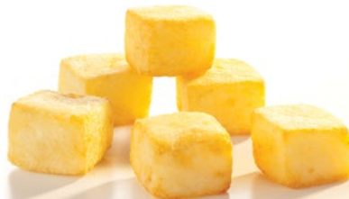
CAVENDISH FARMS® LARGE DICED POTATOES 3/4" X 1" X 1" 56210 04110