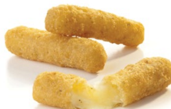
CAVENDISH FARMS® CRISPY TEMPURA MOZZARELLA STICKS - ITALIAN 56210 19185