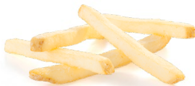
FINE COAT™ 7/16" STRAIGHT CUT - SKIN-ON 56210 07760

Fine Coat 3/8" straight cut french fries (56210 07730).