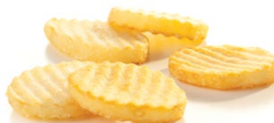
CAVENDISH FARMS® POTATO DOLLARS - CRINKLE CUT 56210 42550