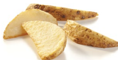
CAVENDISH FARMS® 8-CUT WEDGE SKIN-ON 56210 04519