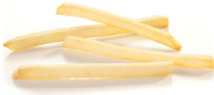
CAVENDISH FARMS® 9/32" SHOESTRING 56210 04011

Give your customers the superior potato taste they crave with Cavendish Farms® Traditional Fries. These premium fries are available in skin-on or skinless options and provide a natural look and flavour sought by potato lovers. Cavendish Farms® Traditional Fries are quick to prepare and deliver top quality and consistency year-round.