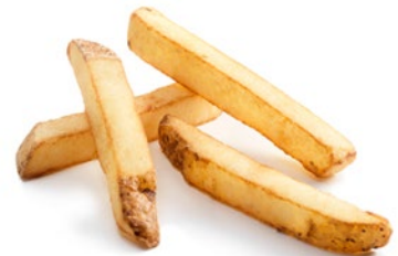
FRESHCUT 1/2" RUSSET - SKIN-ON 56210 04552