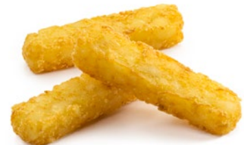
CAVENDISH FARMS® HASH BROWN STICKS (16G) 56210 41565