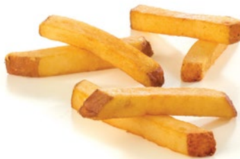
FRESHCUT 7/16" DARK RED NORLAND STRAIGHT CUT - SKIN-ON W/SEA SALT 56210 04570