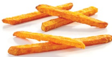
CLEAR COAT 5/16" X 1/2" SWEET POTATO FRIES SLIM STEAK CUT 56210 36811