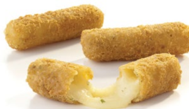
CAVENDISH FARMS® CRISPY TEMPURA MOZZARELLA STICKS PROCESSED 56210 19180