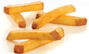
FRESHCUT 7/16" DARK RED NORLAND STRAIGHT CUT - SKIN-ON 56210 04573