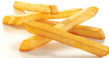
FRESHCUT 7/16" DARK RED NORLAND STRAIGHT CUT 56210 04572