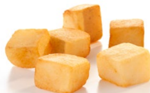
FRESHCUT 3/8" DARK RED NORLAND CHUNKY DICED - SKIN-ON 56210 04561