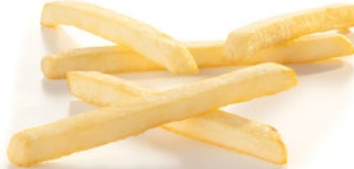
CAVENDISH FARMS® 3/8" STRAIGHT CUT 56210 04001